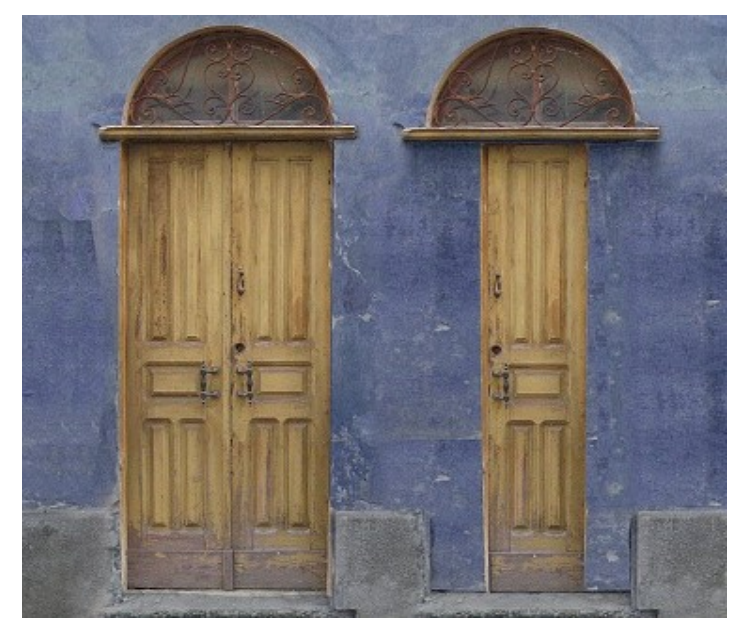
Enter Through The Narrow Door!

September 11, 2022 Fourteenth Sunday after Pentecost 9:30 AM