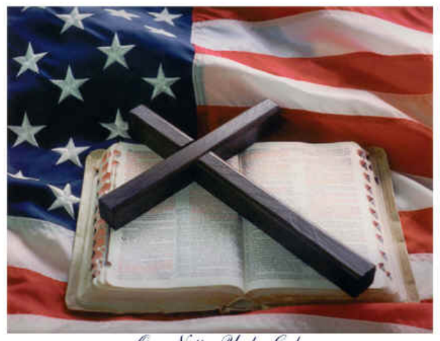
... One Nation Under God ...